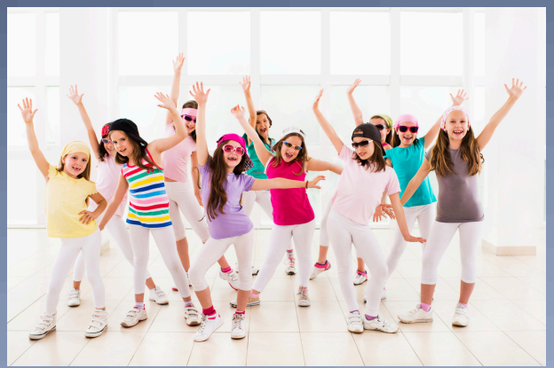
Attire Options: Leotard & leggings Fitted top & leggings Leotard, tights, & spandex shorts