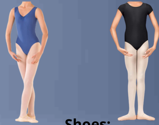
Shoes: Pink ballet shoes