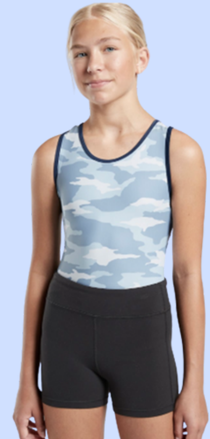
No shoes (barefoot)