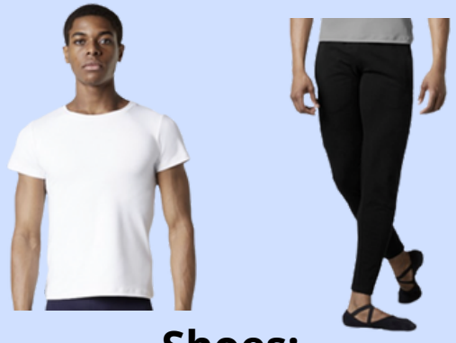
Shoes: Black ballet shoes & black tap shoes