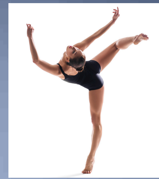
Attire Options: Leotard & leggings Fitted top & leggings Leotard, tights, & spandex shorts