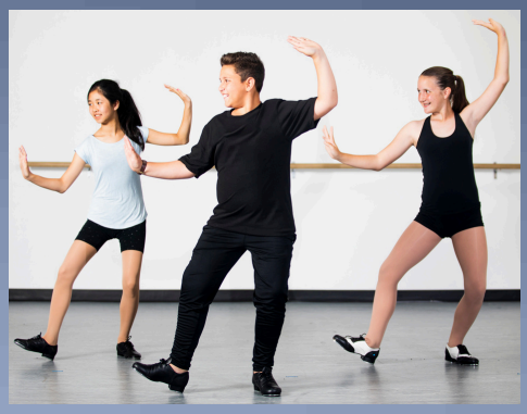
Attire Options: Leotard & leggings Fitted top & leggings Leotard, tights, & spandex shorts