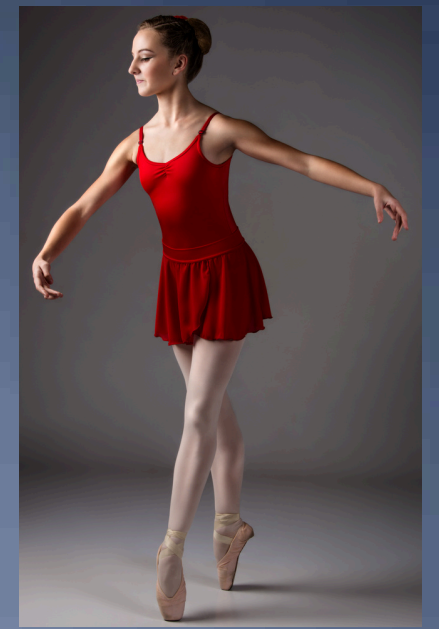
Attire: Leotard, tights & optional skirt (any color)