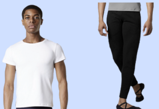
Shoes: Black ballet shoes