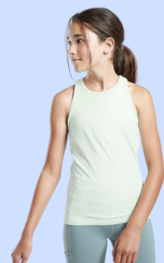
Shoes: Sneakers (no black soles)