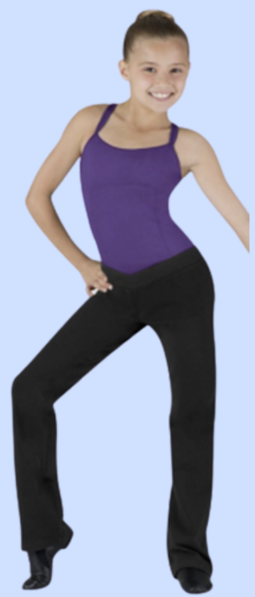
Shoes: Black or tan jazz shoes